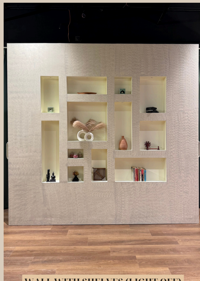
WALL WITH SHELVES (LIGHT OFF)