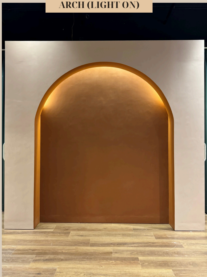
ARCH (LIGHT ON)